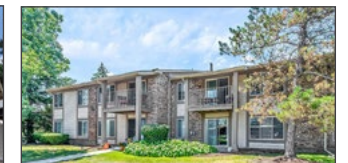
SUMMIT OF FARMINGTON HILLS 154 Units Farmington Hills, Michigan