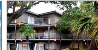
POWER PORTFOLIO 544 Units Dallas, Texas