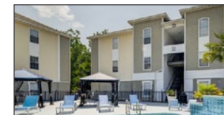
THE VENITIAN STUDENT LIVING 96 Units | 384 Beds Tallahassee, Florida