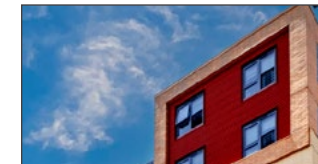
NEW YORK CITY LIHTC PORTFOLIO 1,624 Units Manhattan, the Bronx and Brooklyn