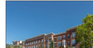
FAIRMONT ON SAN FELIPE 361 Units Houston, Texas