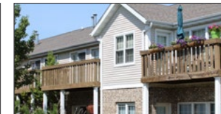
HAMPTON PORTFOLIO 582 Units Rockford, Illinois