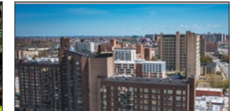
SEA PARK PORTFOLIO 818 Units Brooklyn, New York