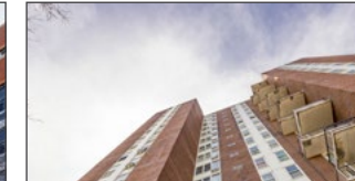
ADVISORY - SIGNATURE PORTFOLIO 9,089 Units New York City