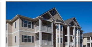
CROSSINGS OF DAWSONVILLE 216 Units Dawsonville, Georgia