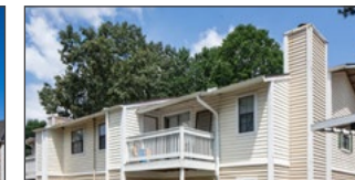
FOREST RIDGE ON TERRELL MILL 406 Units Marietta, Georgia