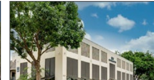
VILLAGE AT PINEY POINT 1094 Units Houston, Texas