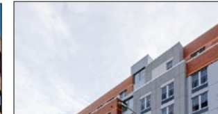
BRONX 2K AFFORDABLE HOUSING PORTFOLIO 1,904 Units | Bronx, New York