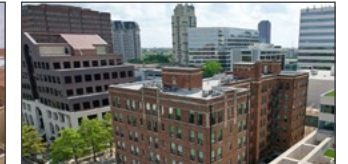
THE ARGYLE 48 Units Dallas, Texas